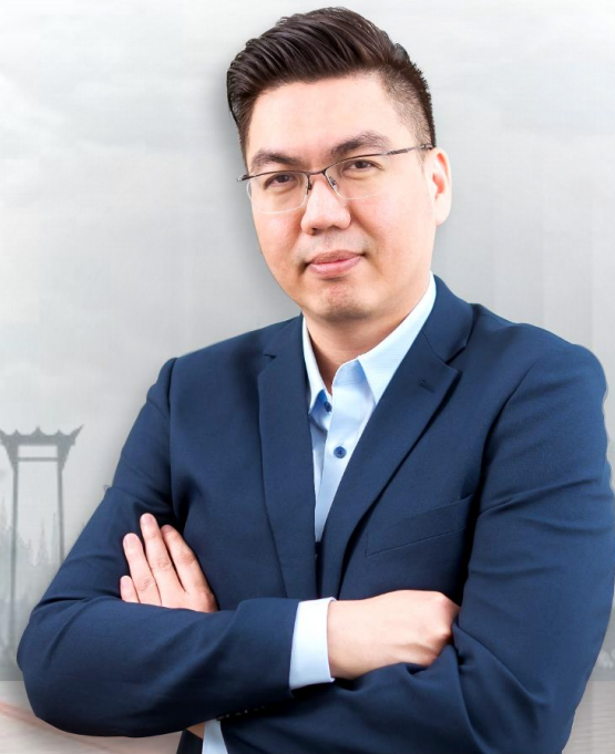
Hisaka Works (Thailand) Co., Ltd. Managing Director,

" WE are HERE " to enrich value to our customers' endeavors by fostering robust relationships and delivering steadfast solutions. With a foundation of sincerity and creativity, we are continuously dedicated to advancing the success of Thailand's industries, leaving a supportive imprint with every step.